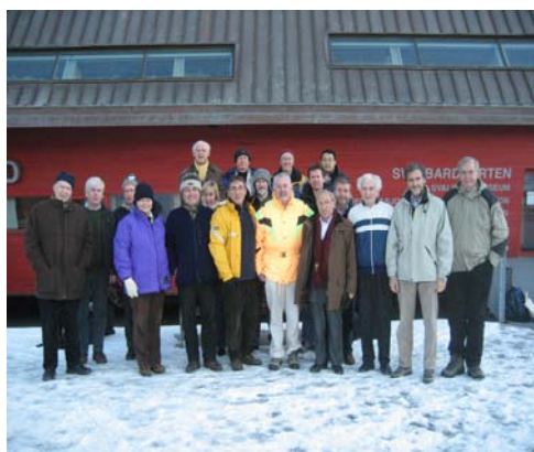
IPY Joint Committee, UNIS, Svalbard, September 2006

The IPY Joint Committee (JC) held its fourth session at UNIS in Longyearbyen, Svalbard, 26-28 September, 2006 – the first JC meeting to take place in the Arctic. The main discussions focussed on the launch event, national events, data coordination and funding.