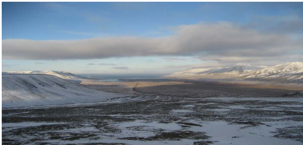
Svalbard, September 2006

Welcome to the second issue of the International Polar Year (IPY) International Programme Office (IPO) bi-monthly newsletter. IPY is co-sponsored by the International Council for Science (ICSU) and World Meteorological Organisation (WMO). The aim of this newsletter is to provide you with updates on IPY IPO activities throughout IPY and alert you to any new developments or events.